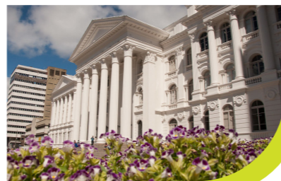
Universidade Federal do Paraná (UFPR) | BRAZIL