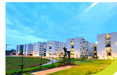
Srishti Manipal Institute of Art, Design and Technology | INDIA