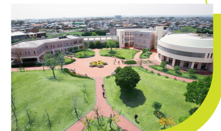
Shizuoka University | JAPAN

The international exchange semester at BESIGN The Sustainable Design School offers students a unique opportunity to study abroad at one of its partner universities while remaining fully integrated into their academic program. Students attend courses as full-time local students in a multicultural environment, gaining valuable international and academic experience. The credits earned abroad (ECTS) are fully recognized and transferred to their degree. While there are no additional tuition fees, students are responsible for travel, accommodation, and living expenses. Throughout the process, BESIGN provides personalized support, from choosing the destination to completing administrative steps, ensuring a smooth and enriching mobility experience.