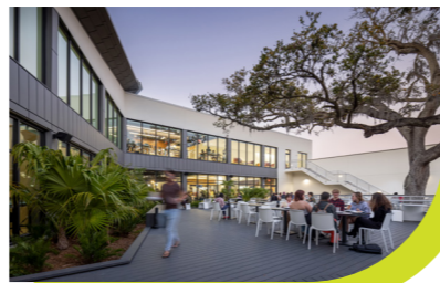
Ringling College of Art & Design | USA